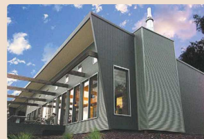
Lindsay 3e from $86,800 similar on display at Victor Harbor