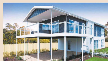
McCubbin 2 Storey from $154,600 on display at Pooraka

At Sarah Homes we design homes to enhance the way you live with more open space for sharing family life or entertaining and more natural light for a warm, relaxing ambience with smaller power bills. How do we achieve this? By using the latest building materials in an imaginative way. And, because they're more inventive, these materials can be used to create more stylish homes. With over 50 designs and prices starting from under $100,000, you'll be surprised how affordable it is to put more life and style into your lifestyle.