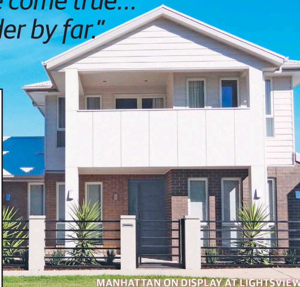
MANHATTAN ON DISPLAY AT LIGHTSVIEW

Portsea 4 2 2 On Display at Seaford Meadows